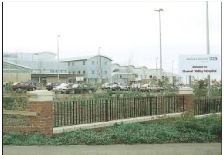
Darent Valley Hospital: nurses complained the design was not conducive to effective care

But irrespective of whether and how much financial risk is actually transferred and to whom, the main risks are those that arise from technical obsolescence, changing regulation, and unmet patient needs, risks which ultimately the NHS, local communities, and patients will have to bear. Should conditions change during a 30 year contract, rendering the facilities unsuitable, the NHS will find itself locked into long term contracts and payments and patients may find they have to go without care.